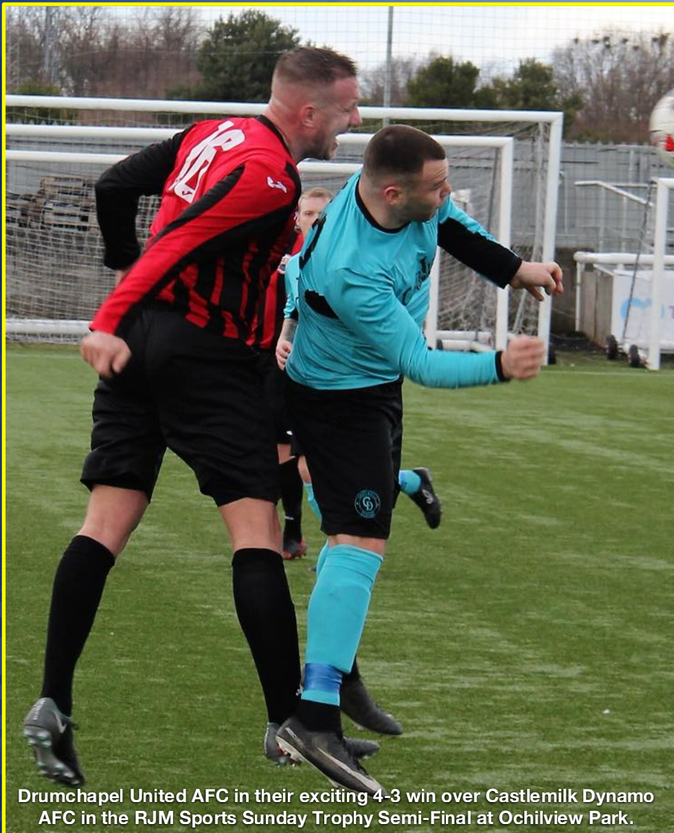
Drumchapel United AFC in their exciting 4-3 win over Castlemilk Dynamo AFC in the RJM Sports Sunday Trophy Semi-Final at Ochilview Park.