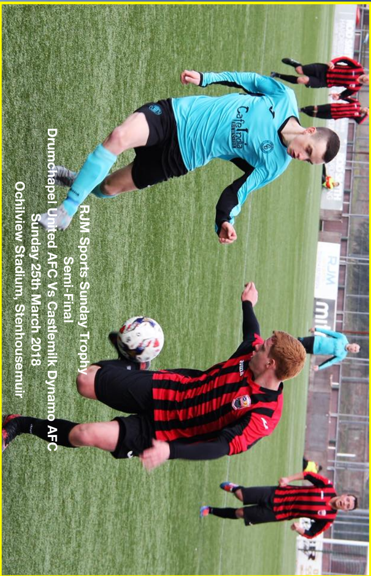
RJM Sports Sunday Trophy Semi-Final Drumchapel United AFC Vs Castlemilk Dynamo AFC Sunday 25th March 2018 Ochilview Stadium, Stenhousemuir