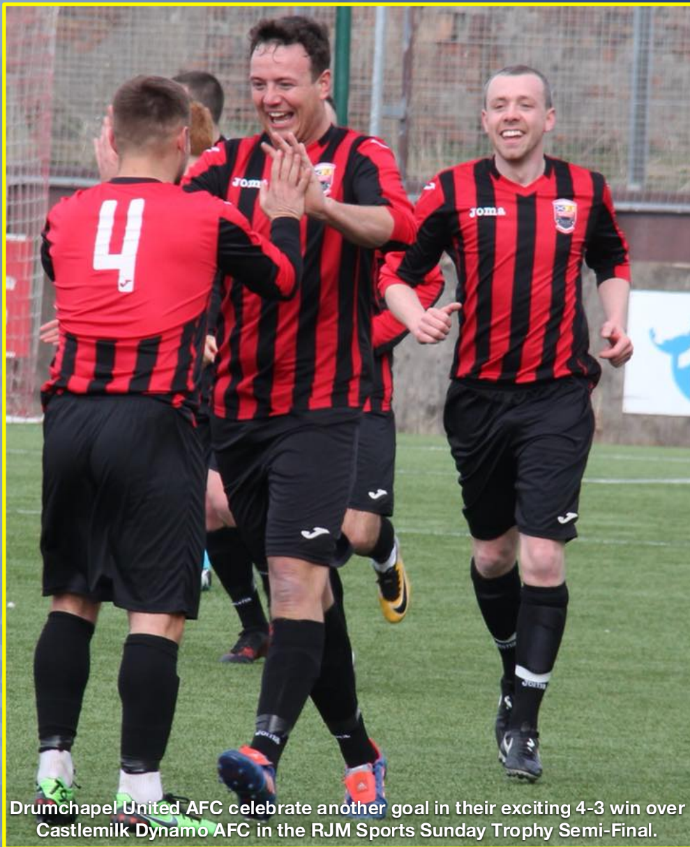
Drumchapel United AFC celebrate another goal in their exciting 4-3 win over Castlemilk Dynamo AFC in the RJM Sports Sunday Trophy Semi-Final.