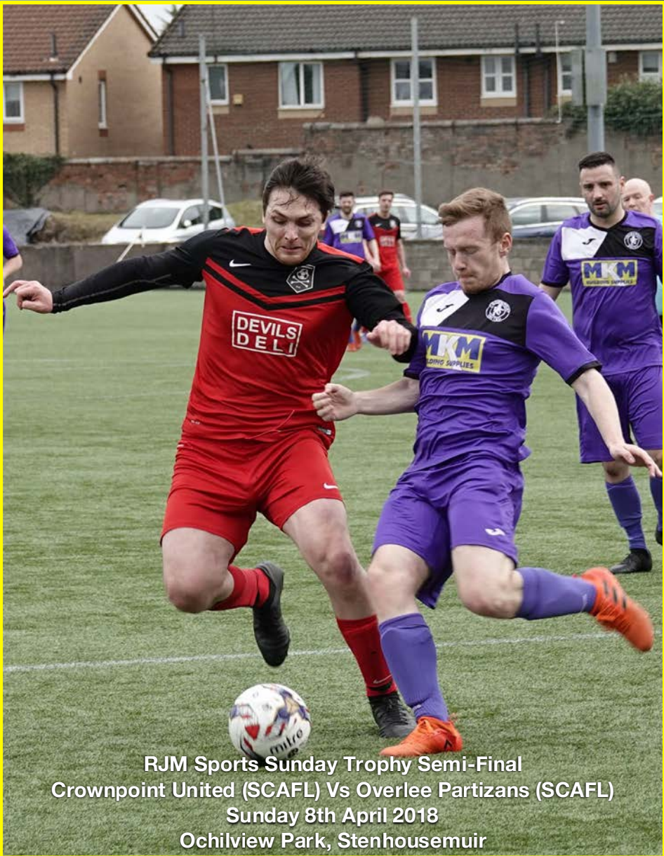
RJM Sports Sunday Trophy Semi-Final Crownpoint United (SCAFL) Vs Overlee Partizans (SCAFL) Sunday 8th April 2018 Ochilview Park, Stenhousemuir