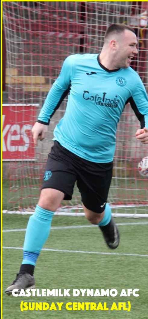
CASTLEMILK DYNAMO AFC (SUNDAY CENTRAL AFL)