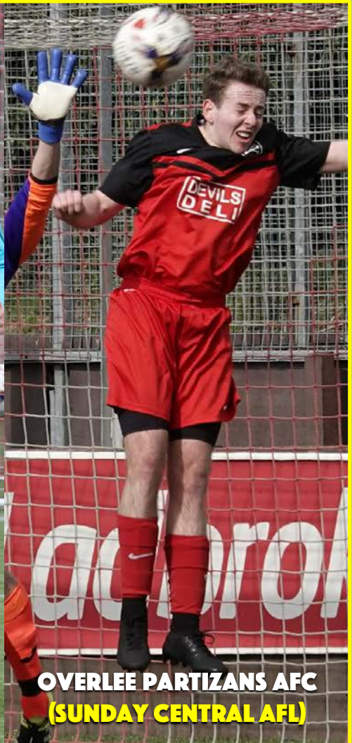
OVERLEE PARTIZANS AFC (SUNDAY CENTRAL AFL)