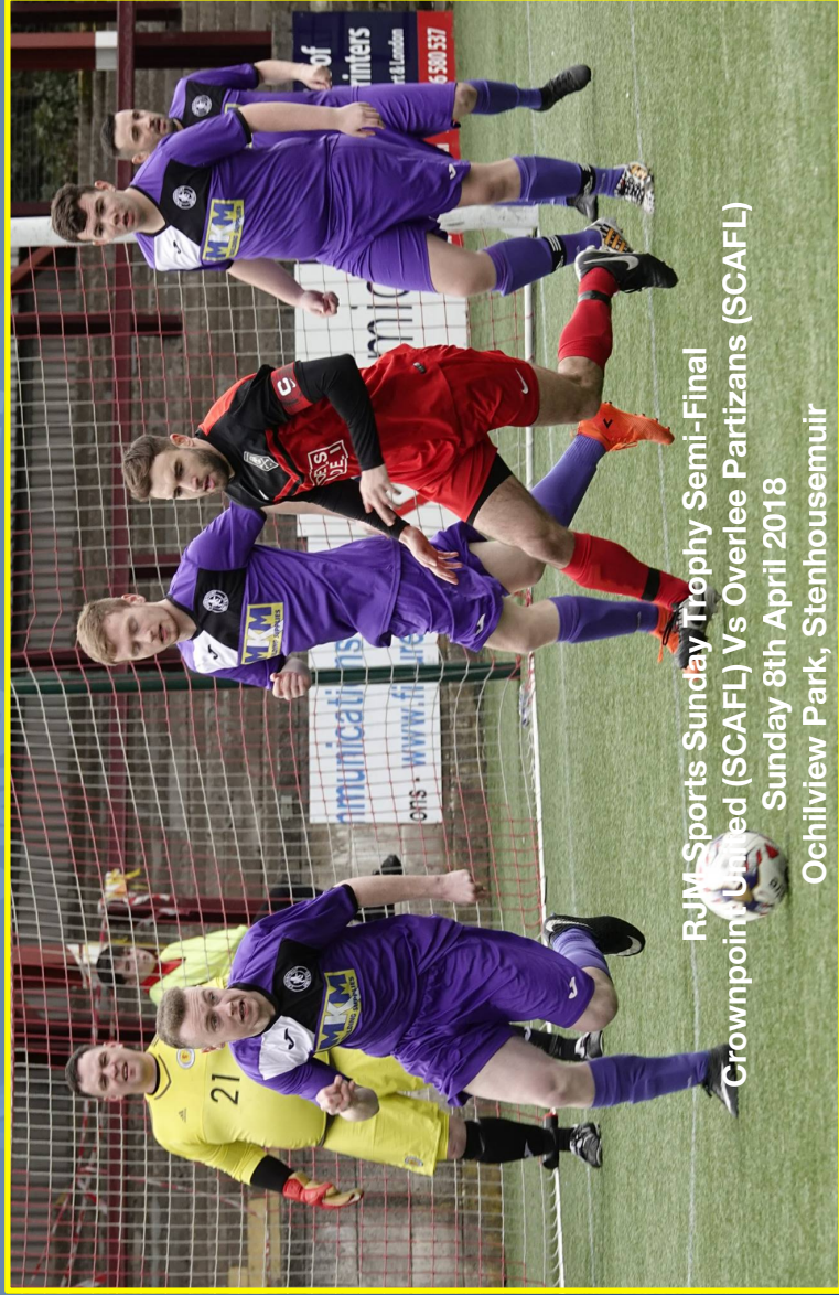
RJM Sports Sunday Trophy Semi-Final Crownpoint United (SCAFL) Vs Overlee Partizans (SCAFL) Sunday 8th April 2018 Ochilview Park, Stenhousemuir