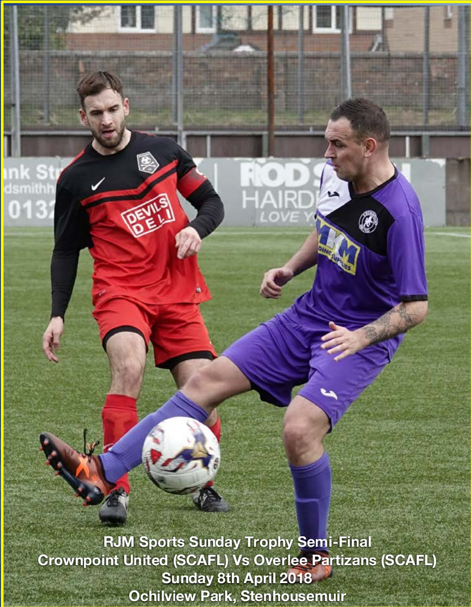
RJM Sports Sunday Trophy Semi-Final Crownpoint United (SCAFL) Vs Overlee Partizans (SCAFL) Sunday 8th April 2018 Ochilview Park, Stenhousemuir